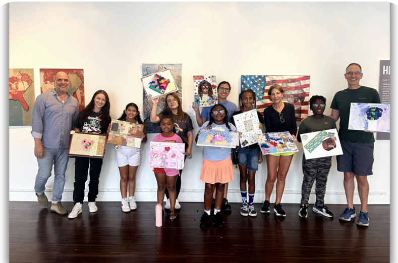
Big Brothers Big Sisters

“As someone who grew up in foster care and as an artist, I found the Heart Gallery workshop especially exciting. When I was younger, creating art became a great outlet for a lot of the confusing, intense emotions that accompanied being in the child welfare system. What makes this program truly remarkable is that it empowers young people with the time, space, and resources to unleash their creativity, while also equipping them with essential life skills for building meaningful relationships. Overall, Florida CraftArt plays a vital role in making art accessible to all members of our community. I will continue to help this organization because not only have they helped me, but they are helping our community.”