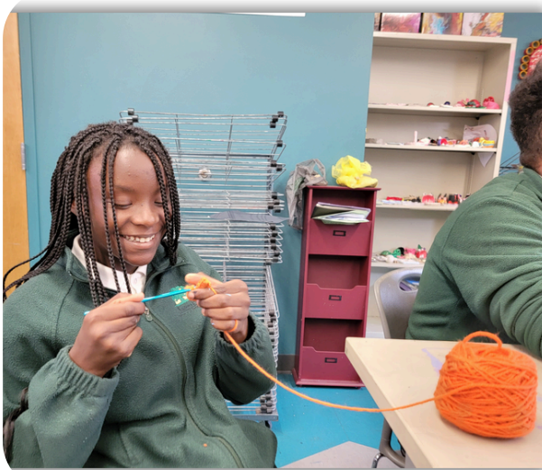
Academy Prep Center for Education

Partnerships for youth programming include: The Heart Gallery of Pinellas & Pasco, Academy Prep, Big Brothers Big Sisters, summer camps and more!